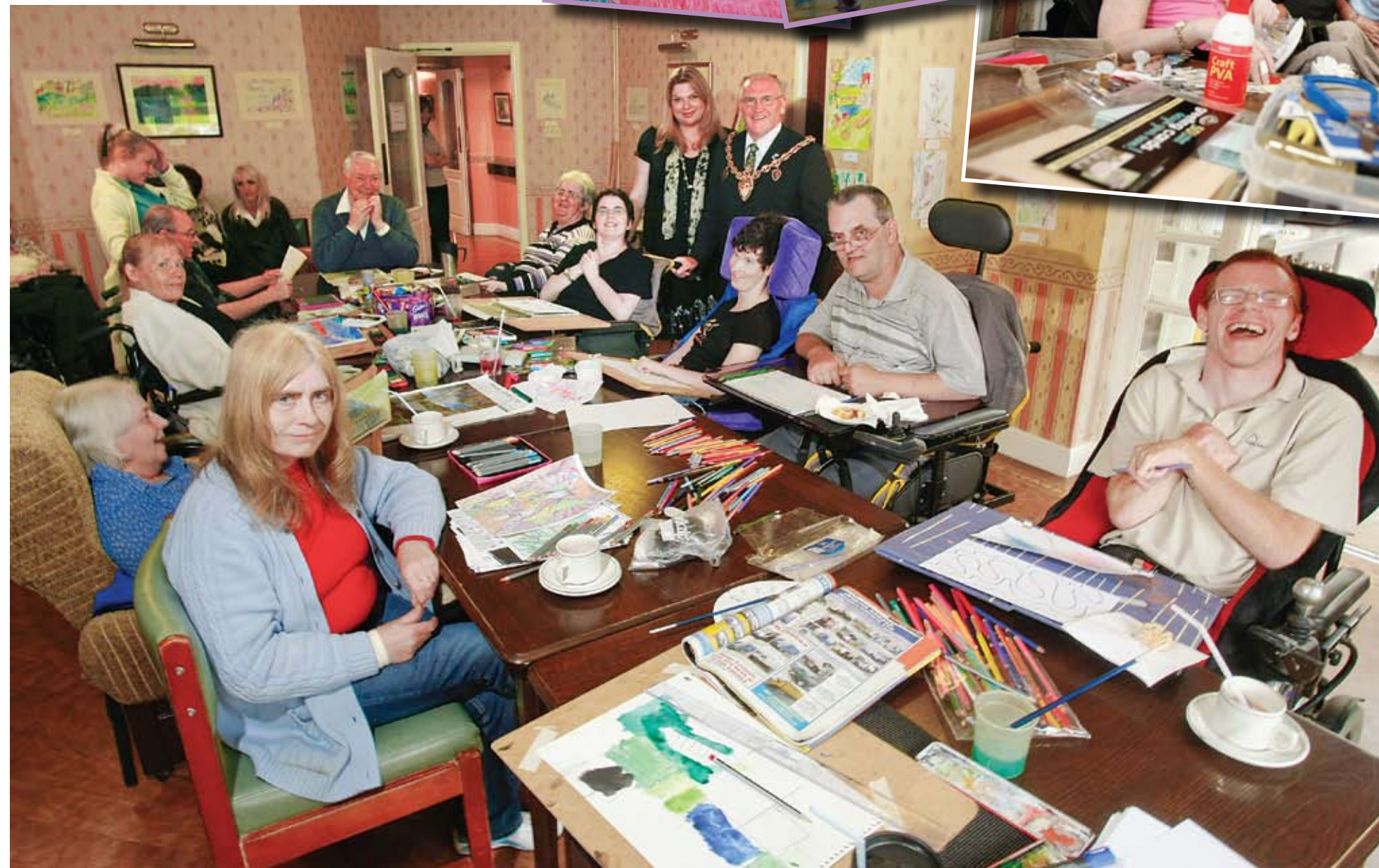
ABOVE LEFT: Some of the art on display